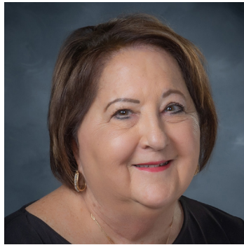
Councilmember District 1 Gloria Raso Tate